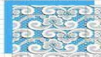
Lace 17b - White/Tonal