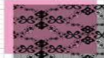
Lace 12a - Black/Contrast