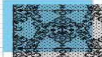
Lace 13a - Black / Contrast