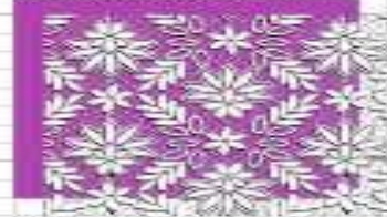
Lace 10b - White / Tonal