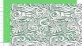
Lace 15b - White / Tonal