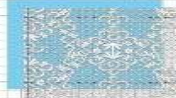
Lace 13b - White / Tonal