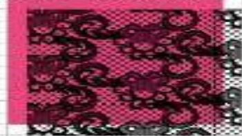
Lace 11a - Black / Contrast