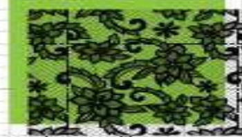
Lace 8a - Black / Contrast

For Tonal Laces, use Live Color to match swatch to background color of fabric. For Contrast Laces, use Live Color to change swatch color as desired).