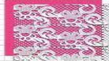
Lace 11b - White / Tonal