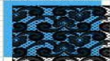
Lace 17a - Black / Contrast