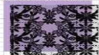
Lace 16a - Black / Contrast