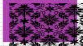
Lace 10a - Black / Contrast