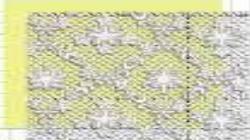
Lace 14b - White / Tonal