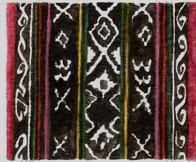
AKAT WEAVE IN MINDANAO