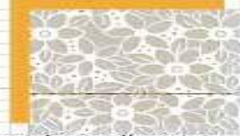
Lace 9b - White / Tonal