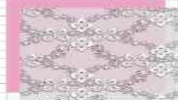
Lace 12b - White/Tonal