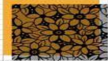
Lace 9a - Black / Contrast