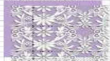
Lace 16b - White/Tonal