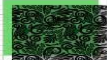
Lace 15a - Black / Contrast