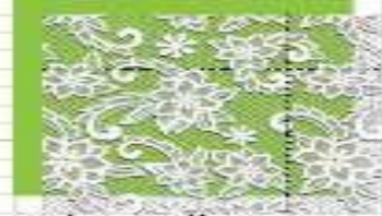
Lace 8b - White / Tonal