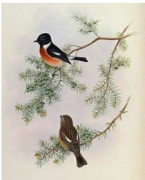
Saxicola maurus indicus on

In art and art criticism, form and content are considered distinct aspects of a work of art. The term form refers to the work's composition, techniques and media used, and how the elements of design are implemented. It mainly focuses on the physical aspects of the artwork, rather than the context in the artwork itself, such as color, value, space, etc. Content, on the other hand, refers to a work's subject matter, significance and style. Namely, the meaning behind the artwork, or context.